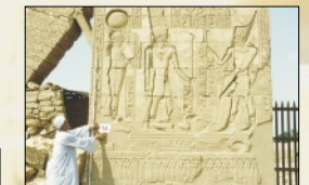
14. Karnak Temple, North gate, SSW-facade, part 1