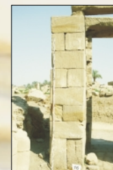
16. Karnak Temple, Chapel of the 26th Dynasty, NW-facade, part 1