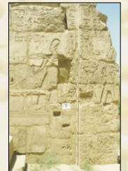
5. Karnak Temple, Temple of Ramesses II, part - SSW-facade