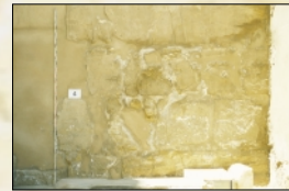
4. Karnak Temple, Second Pylon, part - NNE-facade