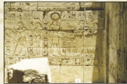
3. Karnak Temple, Temple of Khonsu, Hypostyle Hall, part - SSW-facade