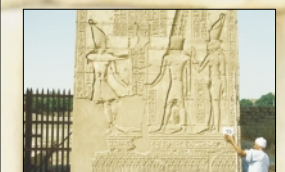
15. Karnak Temple, North gate, SSW-facade, part 2