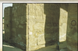
11. Luxor Temple, Court of Ramesses II, part - SE-facade