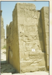
6. Karnak Temple, Temple of Ramesses II, part - WNW-facade