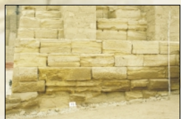
19. Horus Temple, Edfu, Mammisi, part - W-facade