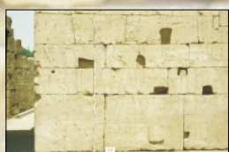
12. Luxor Temple, Hypostyle Hall, part - ESE-facade