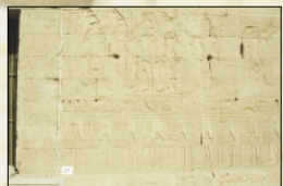
21. Hathor Temple, Dendera, part - ESE-facade

Investigation areas 1-23 / Karnak Temple, Luxor Temple, Horus Temple/Edfu and Hathor Temple/Dendera