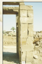
17. Karnak Temple, Chapel of the 26th Dynasty, NW-facade