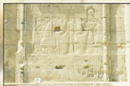
22. Hathor Temple, Dendera, part - NNE-facade