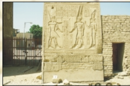
2. Karnak Temple, Gate of Ptolemy III Euergetes, NNE-facade, part 2