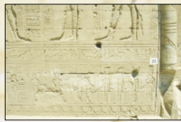
23. Hathor Temple, Dendera, part - WNW-facade