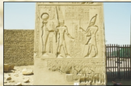
1. Karnak Temple, Gate of Ptolemy III Euergetes, NNE-facade, part 1

Based on the classification scheme of weathering forms developed for the sandstone monuments in Upper Egypt, twenty-three investigation areas at Karnak Temple, Luxor Temple, Horus Temple and Hathor Temple were surveyed with respect to distribution and intensities of weathering forms. The investigation areas show different spectra of weathering forms and their intensities. The state of weathering was further evaluated in dependence upon age and exposure characteristics of the investigation areas, lithotypes and environmental conditions.